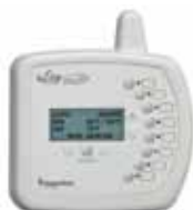
EasyTouch Wireless Controller