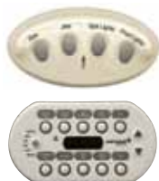
iS4 and SpaCommand™ Spa-side Remotes