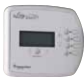
Indoor Control Panel (for 4 or 8 function control)